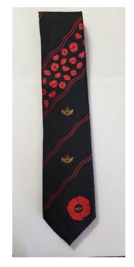
Poppy Tie 30.00 ea. Brevet Tie