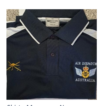
Shirt - Maroon or Navy $35.00 ea.