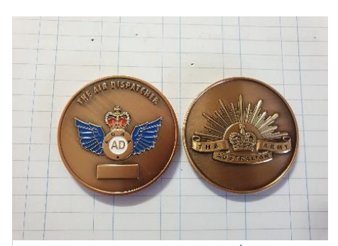
The Air Dispatcher Coin $26.00 ea.