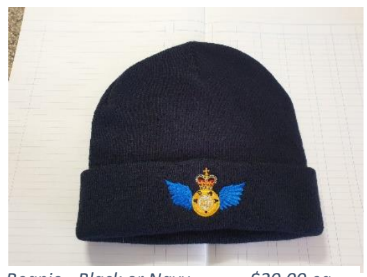
Beanie - Black or Navy $.