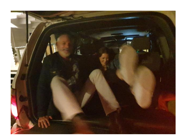
Two people, who are to remain nameless, trying to get out of a vehicle.