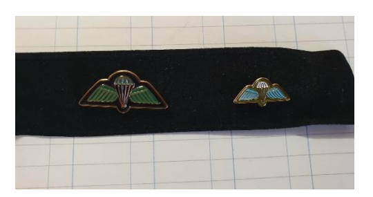
Parra Badge Large