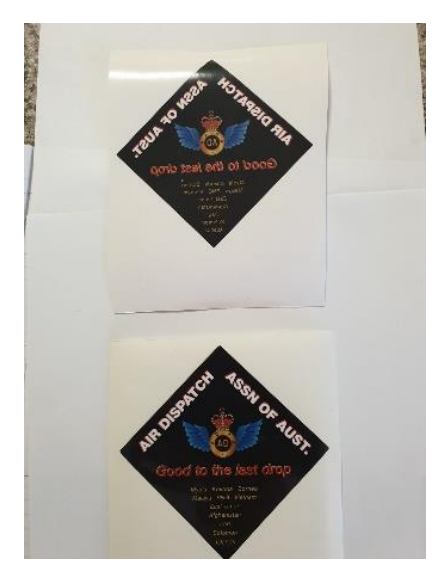
ADAA Sticker $3.00 ea.