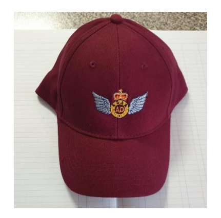
Brevet Cap $18.00 ea

For all your merchandise needs please check out our website shop or contact Rusty Towers (see last page for contact details).