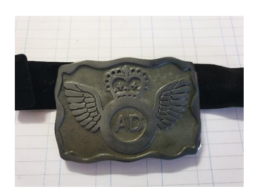
Belt Buckle $28.00 ea.