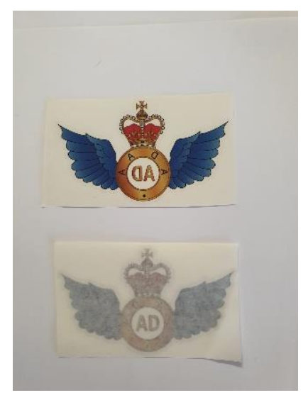
Brevet Sticker $3.00 ea.