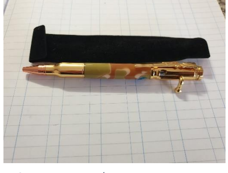
Rifle Pen $20.00 ea.