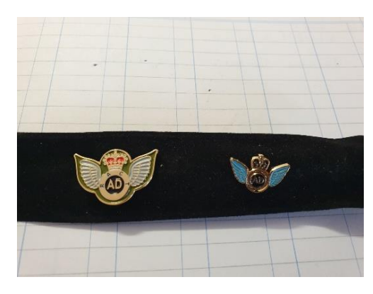
Brevet Badge Large